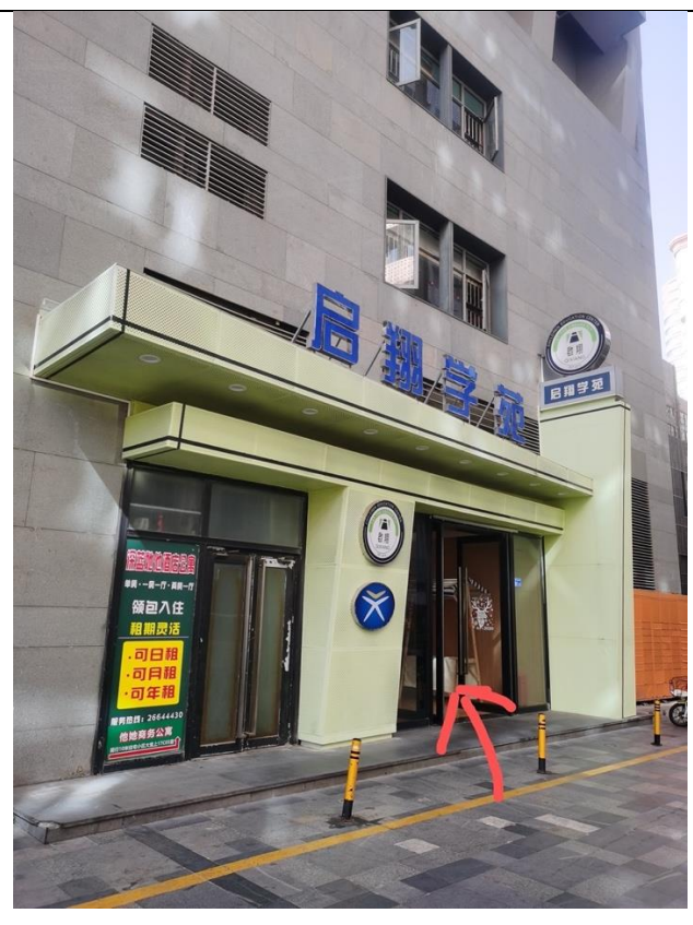
Picture 2: Take the escalator (Main Hall of Kai Cheung College) up to the third floor -Blue Sky Education)